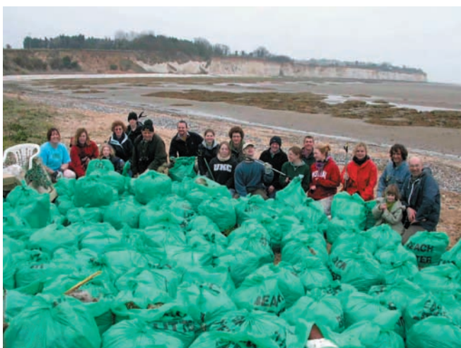
Beach Clean / Thanet Coast Project