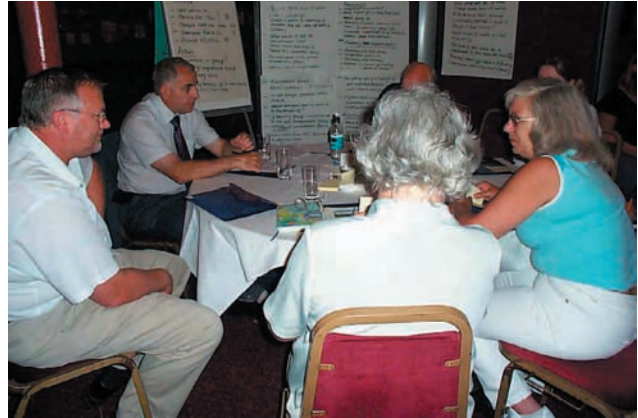
Stakeholder Involvement / Thanet Coast Project

The focus of the dialogue was to find action that was achievable over the next six years and that would continue to foster the sustainable use of coast and sea. To achieve this, dialogue was based around the “subject assessment tables” and the information provided by the stakeholders was fed directly into the tables. A positive result of this process has been that the core of the Management Scheme evolved in tandem with the stakeholder process rather than being written separately afterwards.