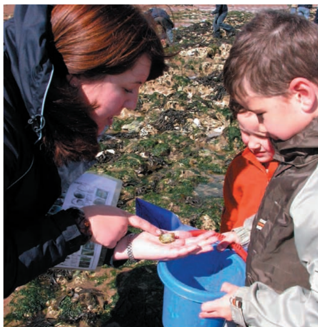
Low Tide Day

The outcomes of these discussions helped guide the choice of management measures required for certain activities.