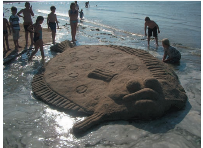
Sand Art / Thanet Coast Project

was now valued more and there was less apathy in people’s attitudes towards managing the European marine sites and surrounds.