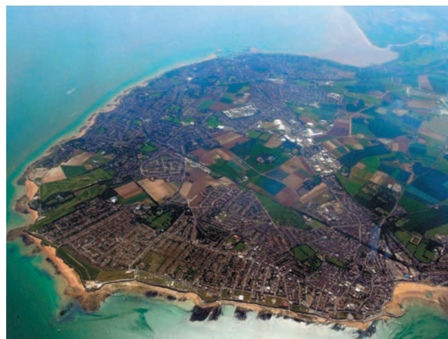
Isle of Thanet / Thanet District Council

As mentioned above, the area covered by this scheme is highly urbanised. The tourist resorts of Margate, Broadstairs and Ramsgate all occur within the coastal fringe of the marine sites. Further west the towns of Whitstable and Herne Bay lie within close proximity to the designated sites. The area falls within the boundaries of three local authorities: Canterbury City Council, Thanet District Council and Dover District Council.