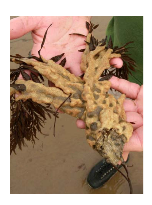
Beware! Native species which look similar are: